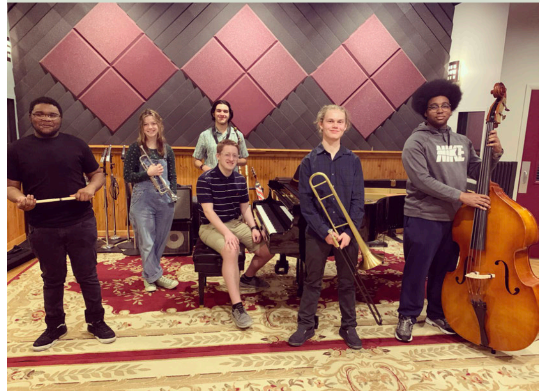
THE 2022 FELLOWSHIP | THE NEXT GENERATION