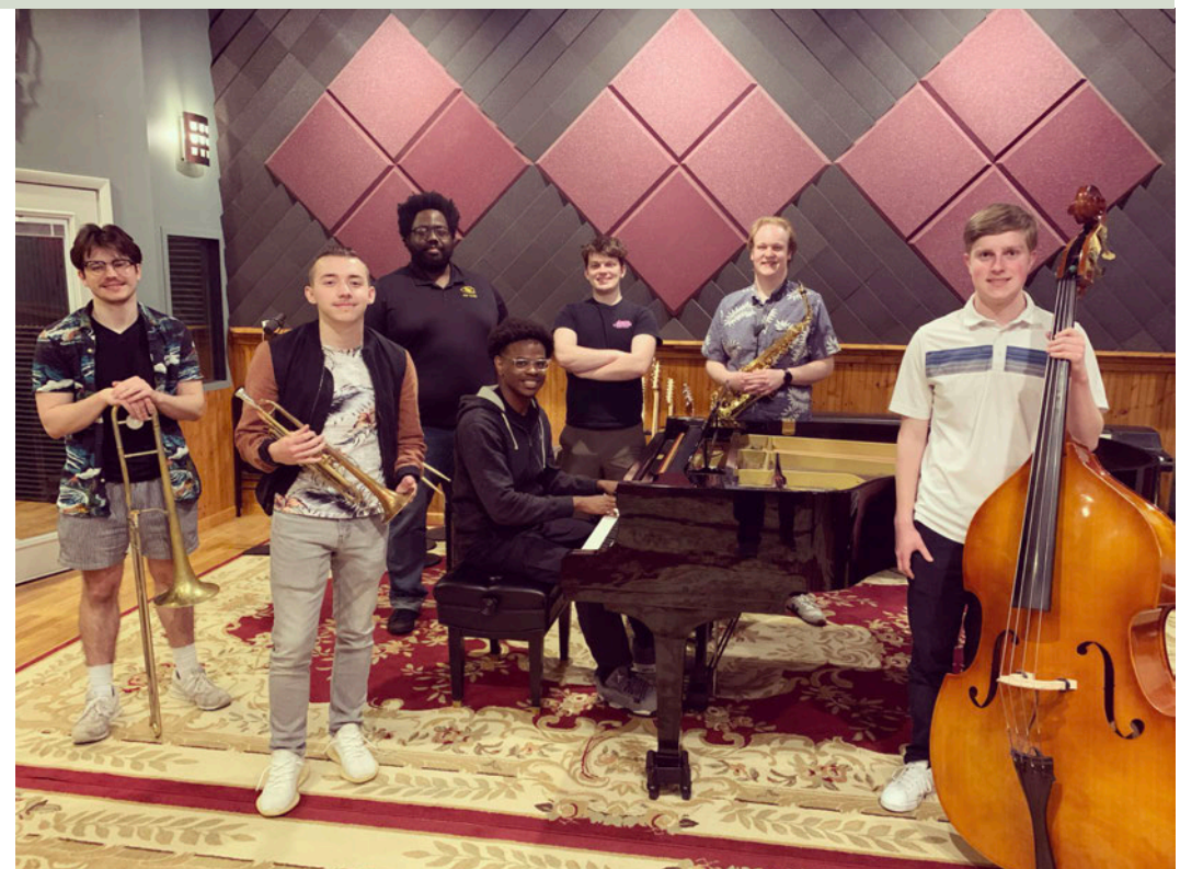
WATSON ENSEMBLE FELLOWS