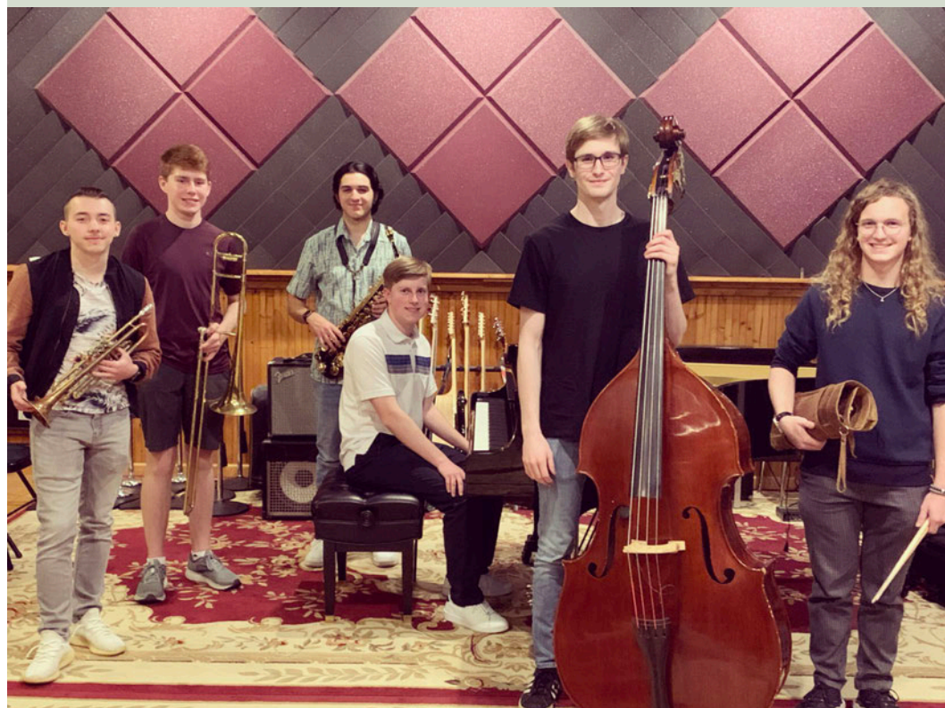
BRADY ENSEMBLE FELLOWS