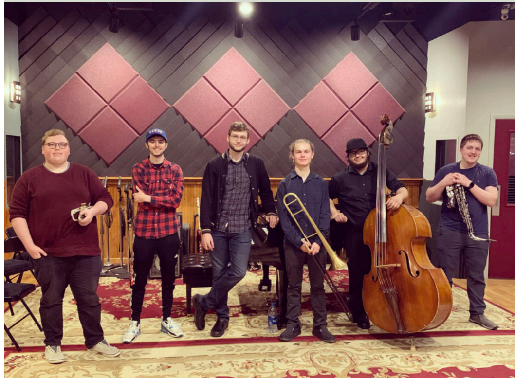
CRAIN ENSEMBLE FELLOWS